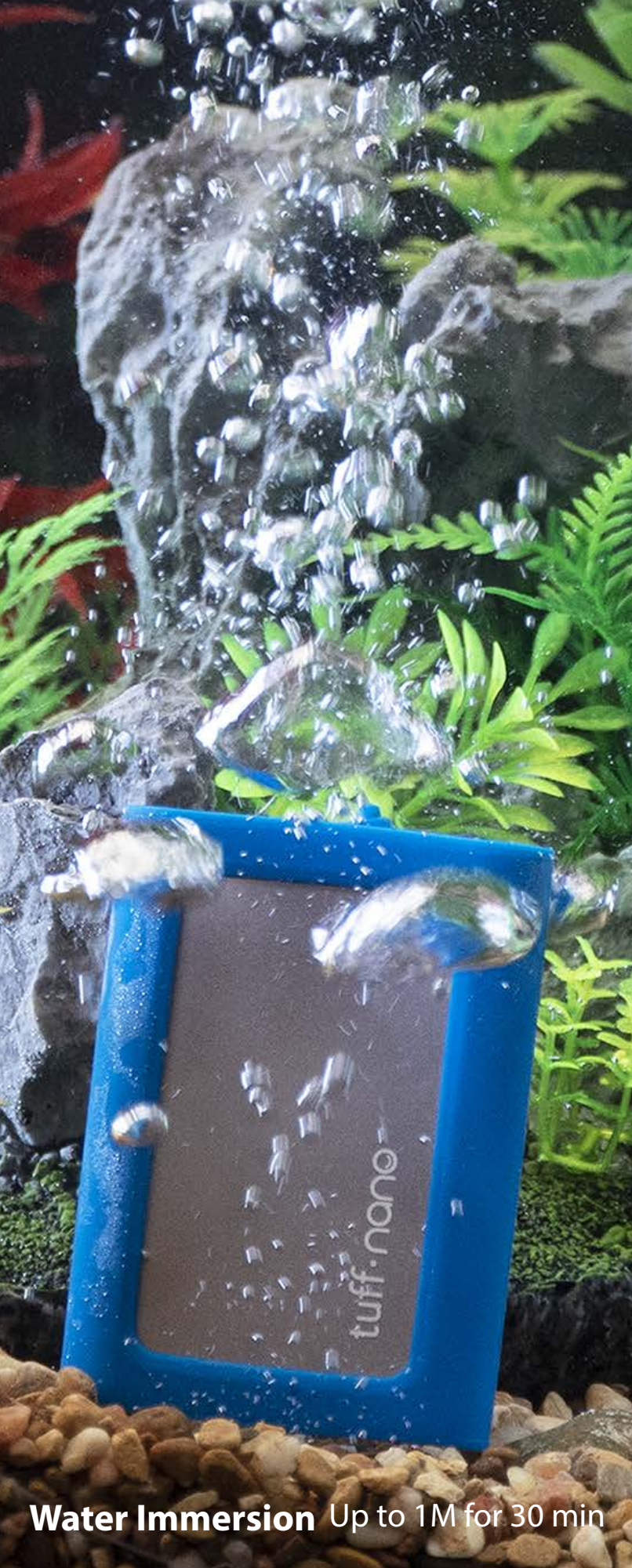
Water Immersion Up to 1M for 30 min

PCIe M.2 NVMe SSD IP67 Certified With Speed up to 1055MB/s