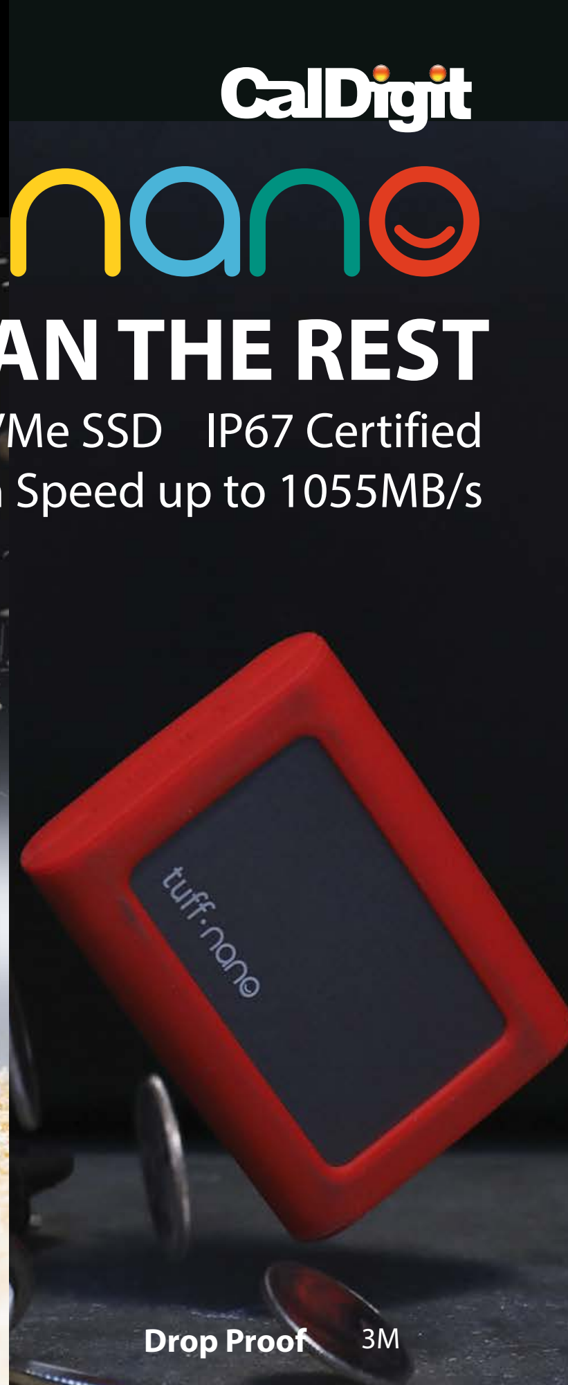
Drop Proof 3M