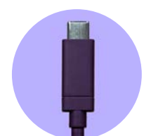
USB-C USB4™ | USB 3.2 | USB 3.1 | USB 3.0