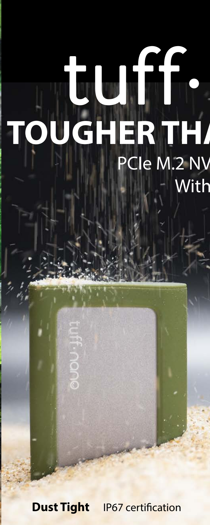
Dust Tight IP67 certification