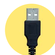
USB-A USB 3.1 | USB 3.0